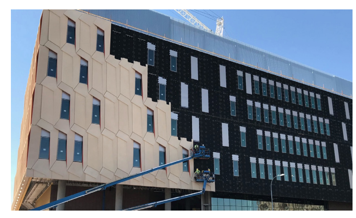
Figure 3: Exposed Cavityrock® Black during construction of Arizona State University in Tempe, AZ

The Cavityrock® Black facer achieved a rating of 5/5 after an exposure to UV light of 250 and 500 hours, with no perceptible change in color, and a rating of 4/5 after an exposure of 750 and 1000 hours, with no significant loss in depth, but a color slightly redder.