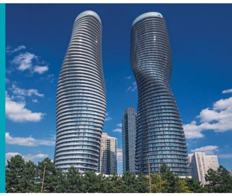
Absolute World Residential Tower: Ontario, Canada