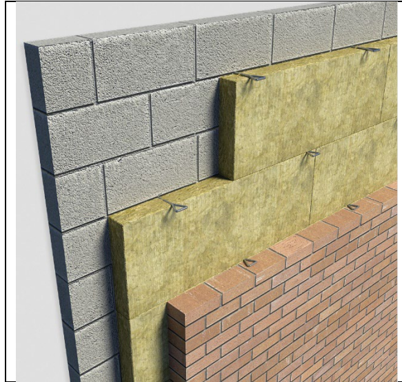
Figure 1 Wall tie positioning

14.7 Slabs are compressed slightly and placed between the upper and lower wall ties to form a closely jointed run.