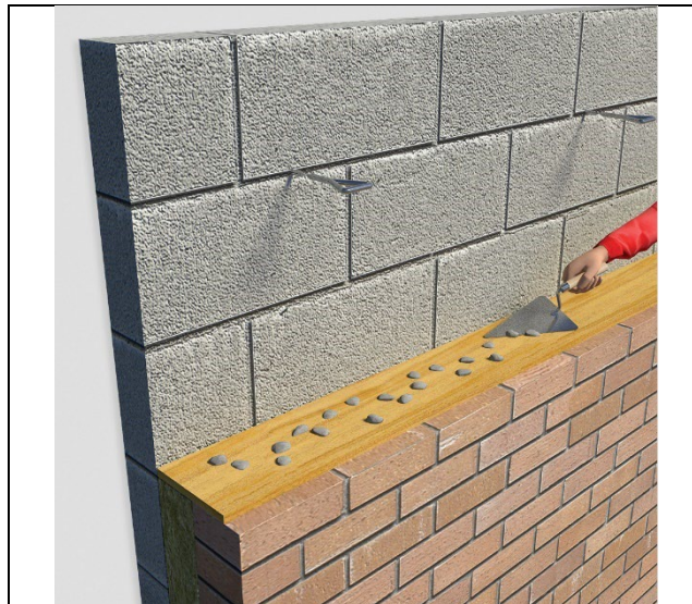
Figure 2 Use of a cavity board when clearing off mortar

14.8 Before installing each course of slabs, excess mortar must be removed from the inside face of the leading leaf, and mortar droppings cleaned from the exposed edges of the slabs. This is made easier using a cavity board (Figure 2). This sequence should be maintained progressively until it reaches the wall plate or cavity tray. It is important for the insulation to be installed to the highest level of each wall with all areas of the wall insulated (see section 13.5).