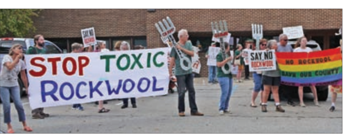
тім соок de

The decision by the JCDA to take no action followed a special meeting Tuesday morning by the Jefferson County Commission. The five-member JCC could have voiced support against the JCDA's voting to OK the bond, but instead the com-