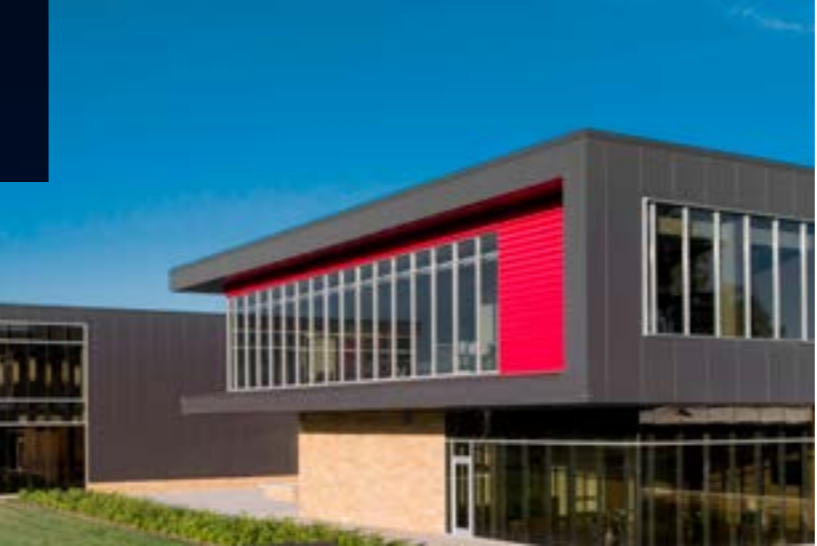
Hospitals and educational institutions

Wherever buildings or venues expect to see a large number of visitors, patients or workers, sandwich panels with stone wool provide increased safety, sound absorption, energy efficiency and sustainability. The building – and the assets and people within it – will directly benefit from the 7 Strengths of Stone, for decades to come. Here are just some examples of commercial, industrial and logistics buildings that benefit from sandwich panels made with ROCKWOOL stone wool at the core.