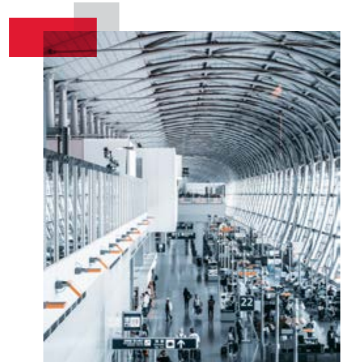
Airport terminals and maintenance hangers