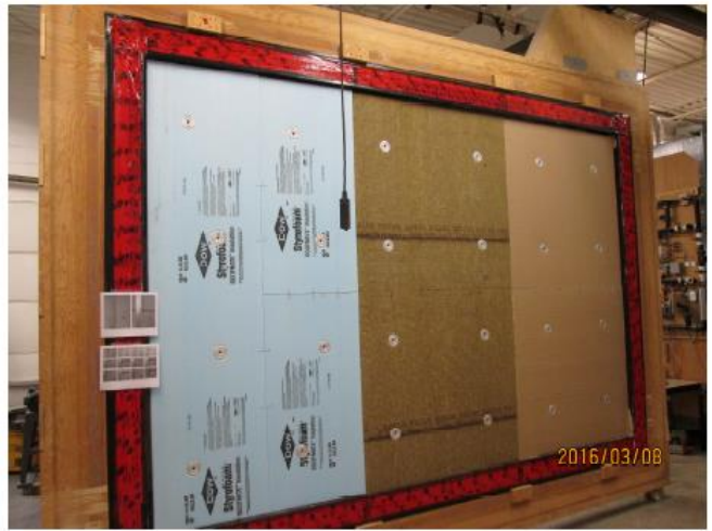
Figure 1: Full scale roof assemblies, Phase 2a (from left: XPS, ROCKWOOL TOPROCK DD, Polyisocyanurate)

Testing and evaluation was conducted by RDH Building Science Laboratories.