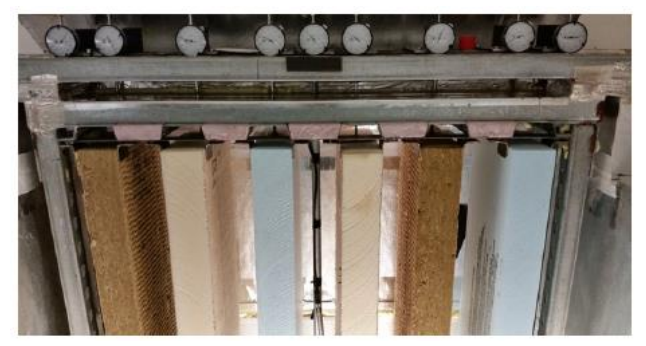
Figure 2: Phase 1 testing chamber

The research program can be divided into 2 distinct phases. Phase 1 included unrestricted material testing evaluating expansion and contraction on the x, y and z axes (length, width and thickness). Testing was conducted in a climate chamber consisting of a metal rack built into a highly insulated enclosure. A total of 6 samples were tested, 2 of each insulation types.