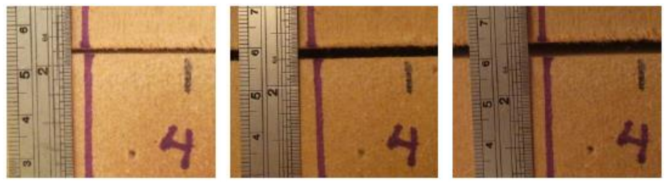
Figure 3: Photographs of measurement location for polyisocyanurate during Phase 2a, cycle #1, #3 and #6 at -18°F (-28°C)