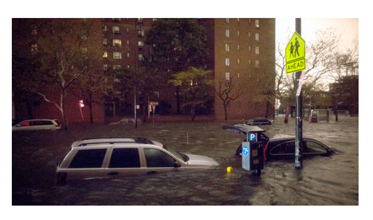
Flooding caused by Hurricane Sandy had devastating consequences for New York City, particularly for its low-income residents. XXVIII

Hurricane Sandy was a moment of truth for New York City, demonstrating that the climate crisis is also about a crisis of inequality. Fifty-five percent of the storm surge victims in New York after Hurricane Sandy were very low-income renters, whose incomes are $18,000 a year on average. XVIIII At the same time, those with excess wealth were able to leave the city, rent hotel rooms and in some cases bring domestic workers with them to care for their children. XIX While some neighborhoods in New York City are still being rebuilt three years after Sandy, Wall Street's Stock Exchange was up and running within two days of the