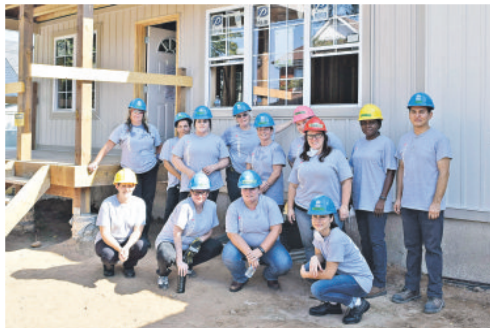
One of numerous groups of ncwomen who have participated in Habitat for Humanity women's builds to help build homes for families in need in Niagara.

People need to know that what they do matters and every person in our company has an important role in our business's success.