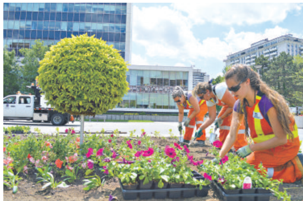
Dedicated staff from the Public Works Horticultural division work hard to brighten up our spaces.

Provide public services to approximately 537,000 residents