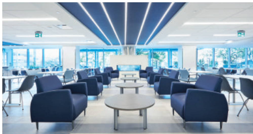
At the centre of our new facility, is a contemporary and spacious cafeteria – equipped with comfortable loungers, serene fireplace, functioning terrace and access to our healing garden. Evidence shows that space, natural light, and homelike features are shown to promote wellbeing and create healing environments.

highways for easy access from all directions.