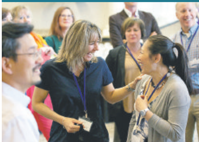
Boehringer Ingelheim (Canada) employees at the company's Value Through Innovation Day.