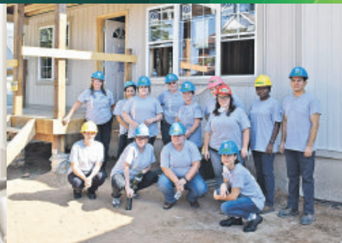
Employees at Niagara Casinos participate in a Habitat for Humanity women's build.

VIEW ONLINE AT thespec.com/top-employers