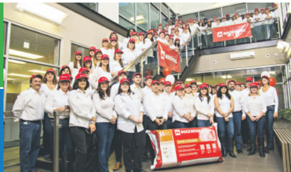
Employees at ROCKWOOL celebrate the company's 80th Anniversary in 2017.

Offers tuition subsidies up to $10,000 for job-related courses