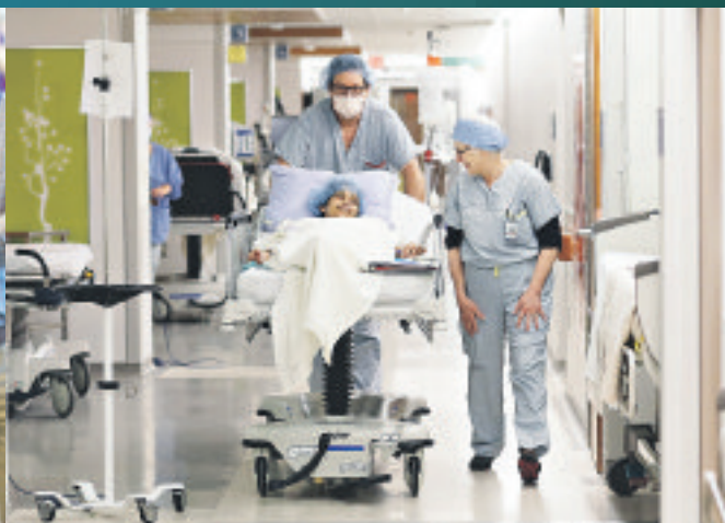
On the way to surgery at St. Joseph's Healthcare Hamilton.